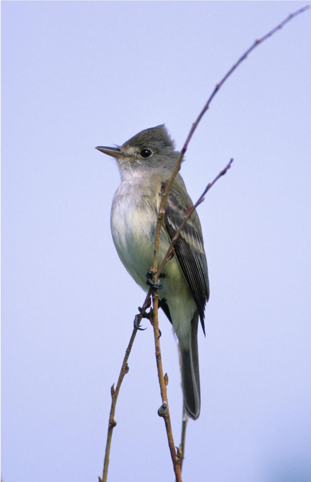
Willow Flycatcher.