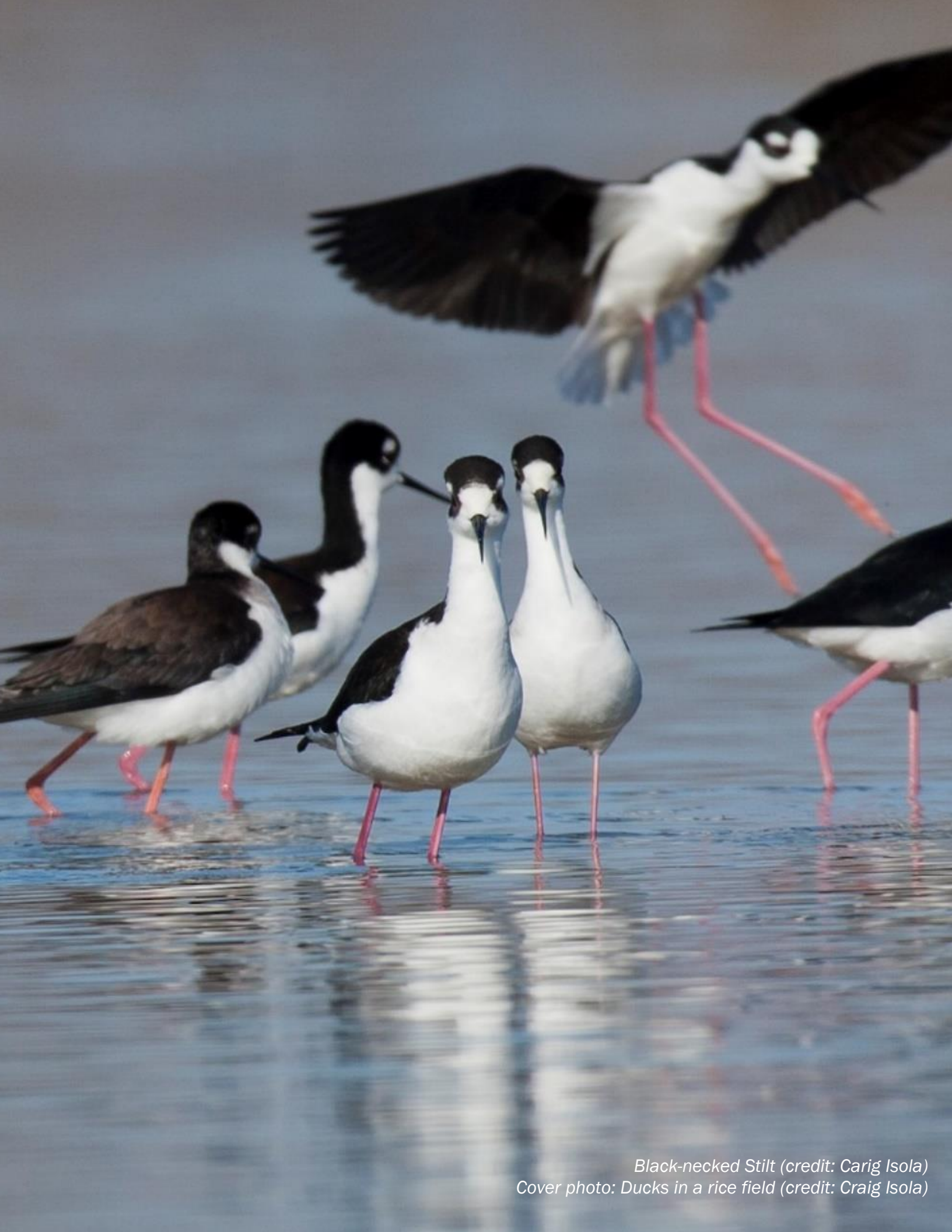
Black-necked Stilt Cover photo: Ducks in a rice field