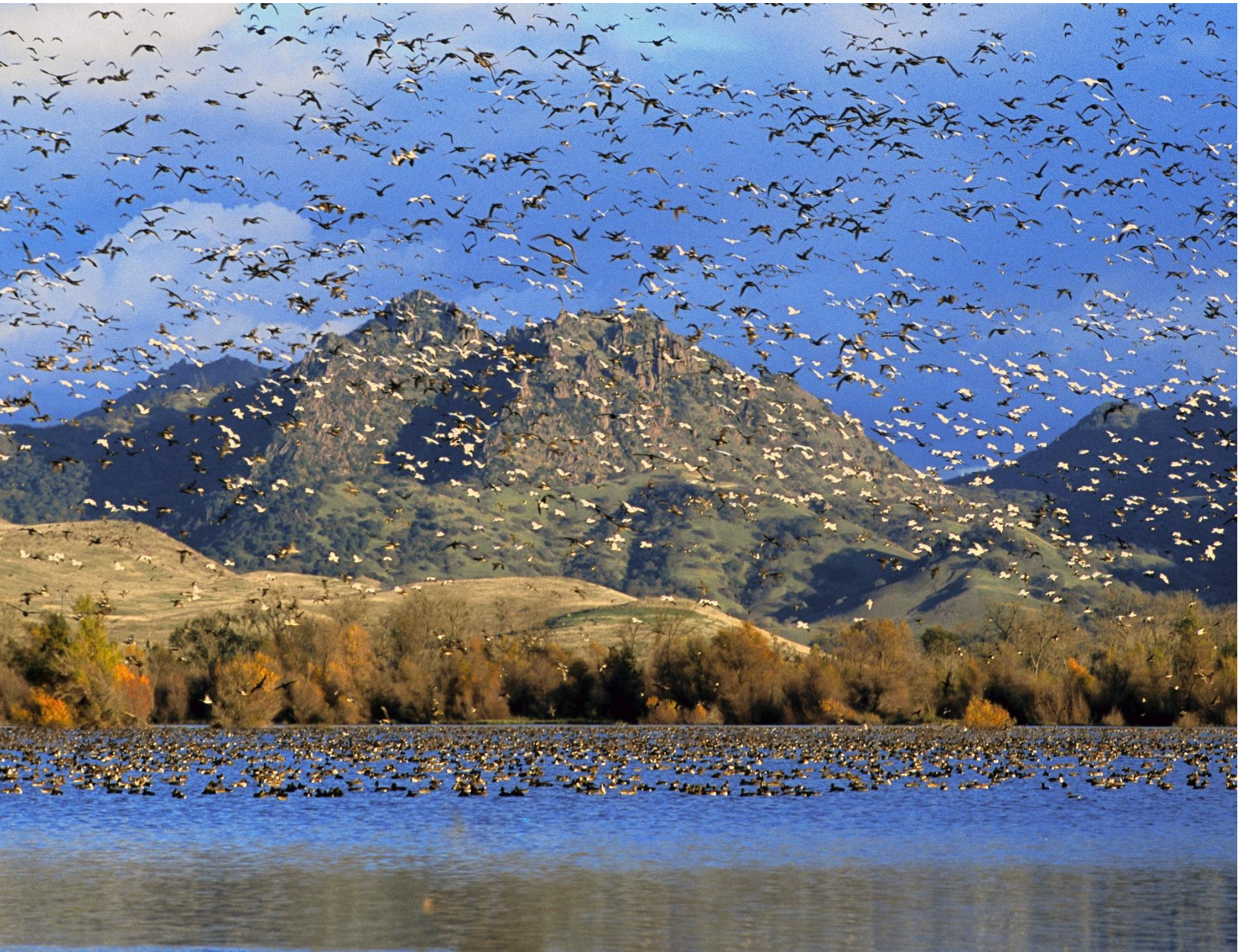
Butte Sink.