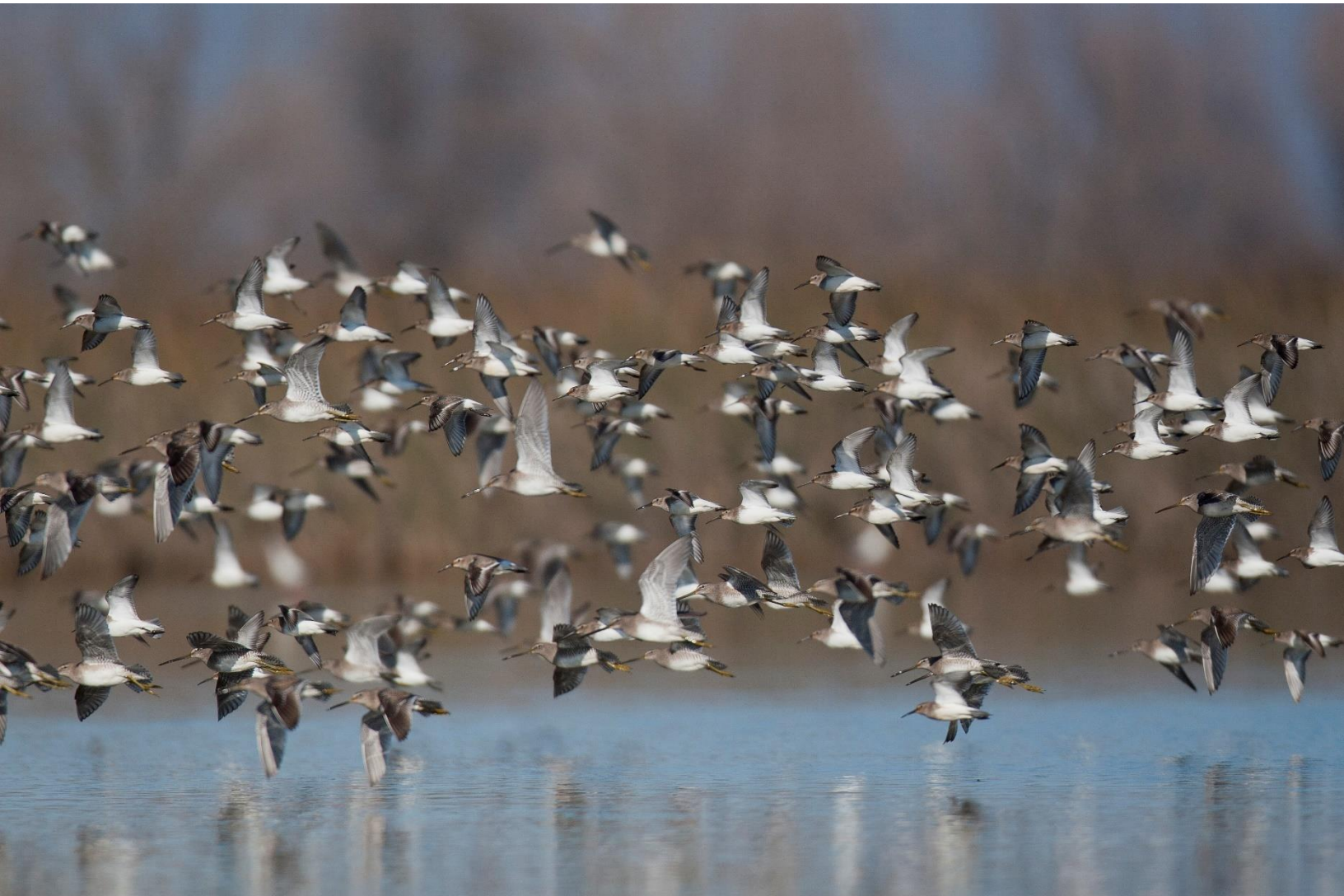
Dunlin and Dowitchers.