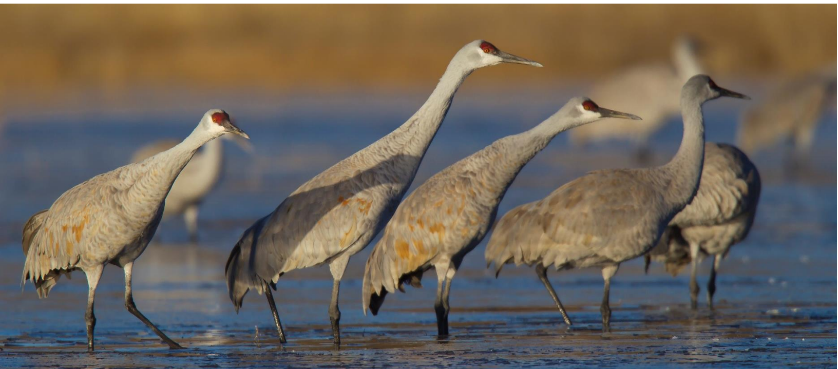
Sandhill Cranes.

The development and completion of this Science and Knowledge Needs document follows the release of the CVJV 2020 Implementation Plan (2020 Plan). The 2020 Plan included several elements of SHC, notably biological planning and conservation design, and provided some guidance for conservation delivery. The 2020 Plan was developed using the best available science, as directed by the predecessor of this document, the 2010 CVJV Monitoring and Evaluation (M&E) Plan. In the spirit of innovation and adaptive management, this Science and Knowledge Needs Plan represents a more comprehensive assessment. It is intended to evaluate progress toward the biological objectives and to test whether the conservation strategies and actions yield the intended ecological and social outcomes. The iterative process of testing biological assumptions to improve conservation planning and delivery is germane to the SHC process, and it bridges the gap between managers and researchers.