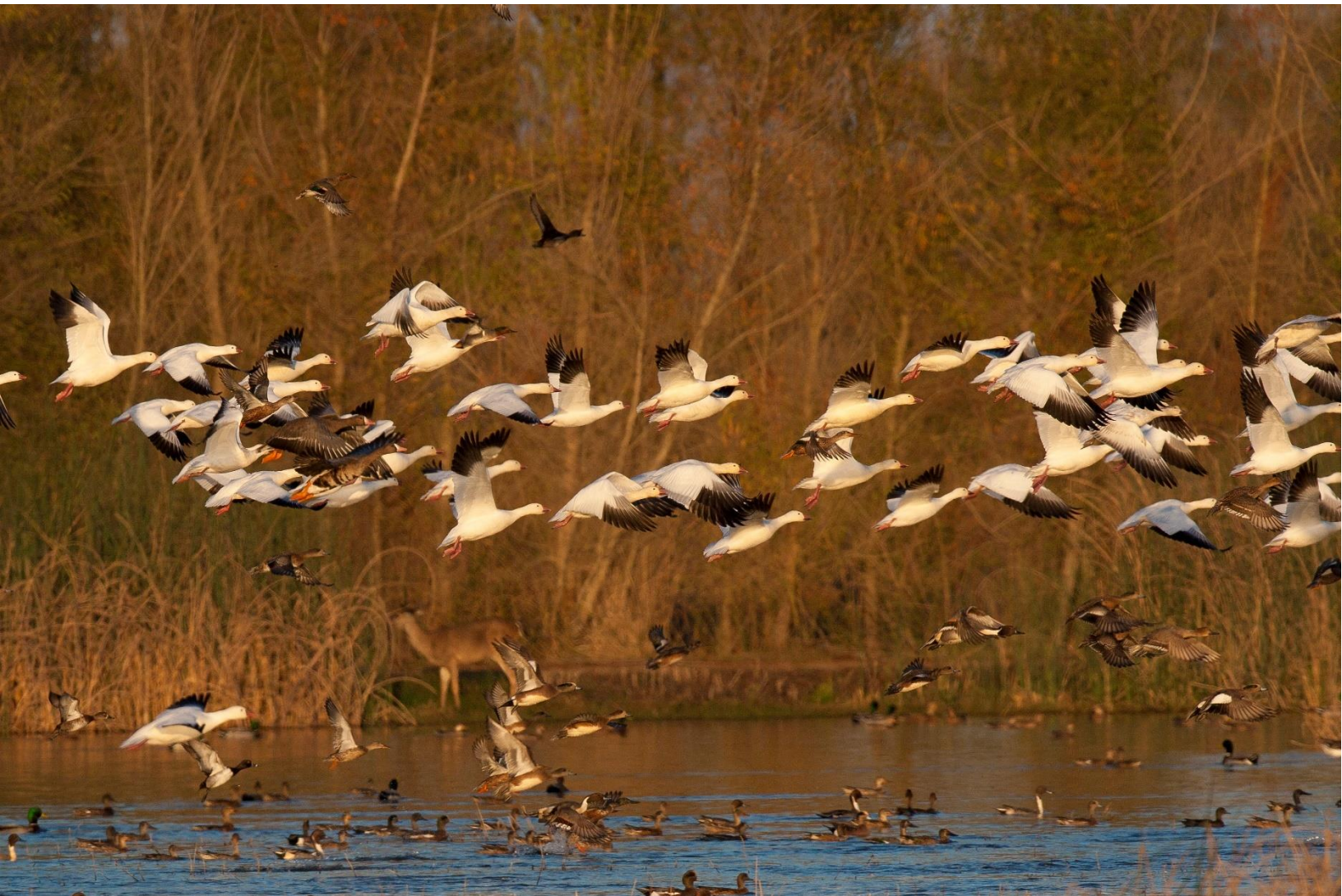
Colusa National Wildlife Refuge.

See the Science Needs Library for current list of relevant literature, with a focus on approximately the last 10 years.