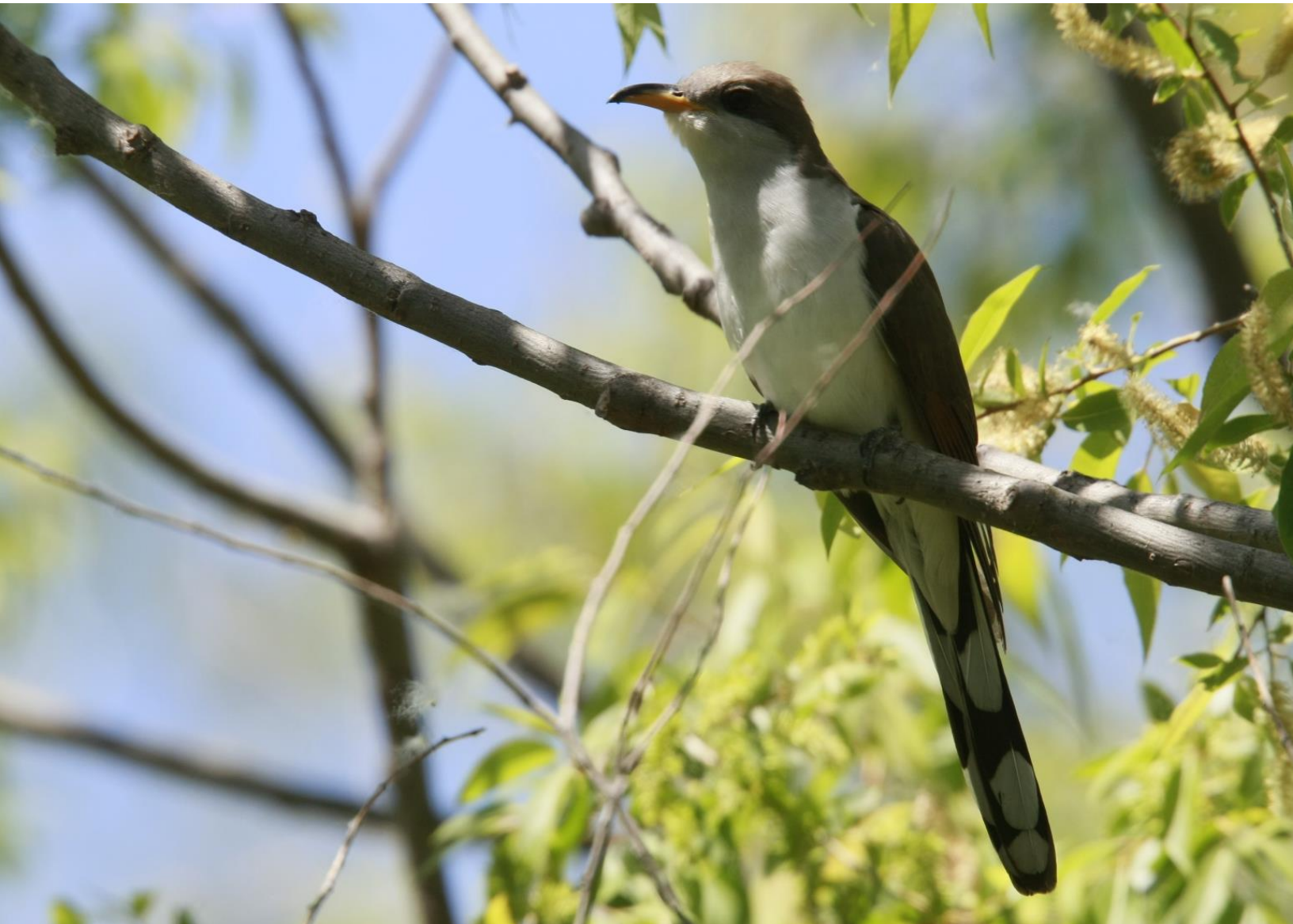
Yellow-billed Cuckoo.

2020 Plan = 2020 CVJV Implementation Plan CDFW = California Department of Fish and Wildlife CVJV = Central Valley Joint Venture IWJV = Intermountain West Joint Venture M&E = Monitoring and Evaluation SHC = Strategic Habitat Conservation SGMA = Sustainable Groundwater Management Act SONEC = Southern Oregon, Northeastern California ecological region USFWS = United States Fish and Wildlife Service.