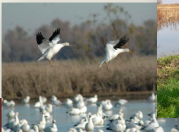
Snow Geese

The Management Board is comprised of 20 Federal & State agencies, conservation organizations and one corporation. The Joint Venture partners work together at local and regional levels to promote conservation for the benefit of birds, associated wildlife, and the American people.