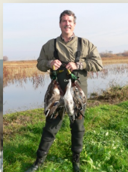
Duck Hunter