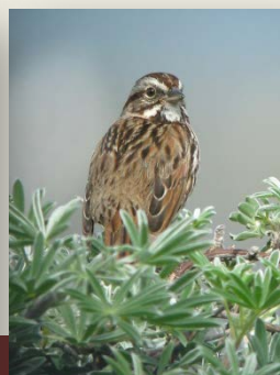
Song Sparrow