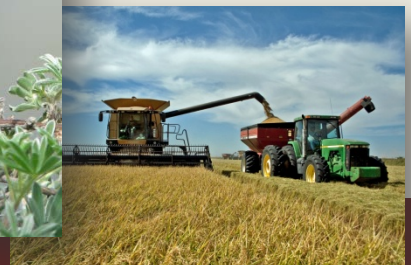
Harvester in Rice